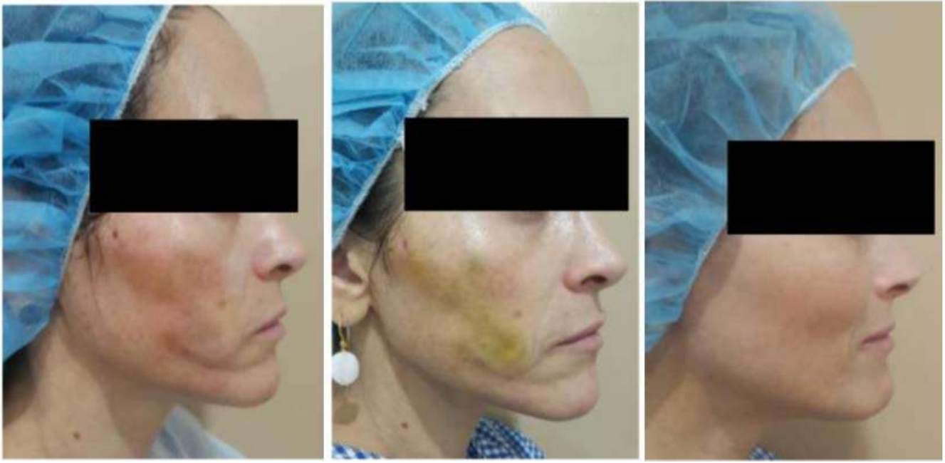
Figure 2. Clinical evidence of progress at 7, 21, and 45 days respectively.