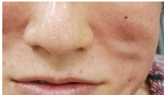
FIGURE 3 Skin dimpling after thread lift

This is an open access article under the terms of the Creative Commons Attribution License, which permits use, distribution and reproduction in any medium, provided the original work is properly cited.