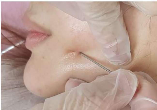
FIGURE 5 Treat the skin dimpling by 18-G needle subcision

Treatments of complications of thread lift are highly valued. Suture removal is necessary when displacement of the barbed threads happen. Bertossi et al advised the patient to massage the thread three times a day for 6 days, and the threads subsequently were extracted by the surgeon in the direction opposite that of placement. Mild skin dimpling, erythema, infection, and temporary facial stiffness that happened occasionally. 5