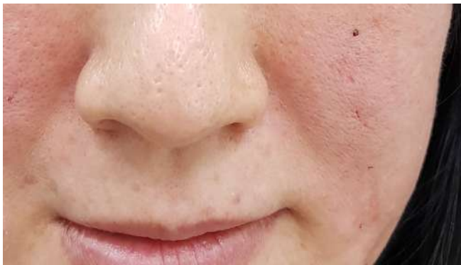
FIGURE 4 Manual therapy release the tension of cog threads in the direction opposite that of placement