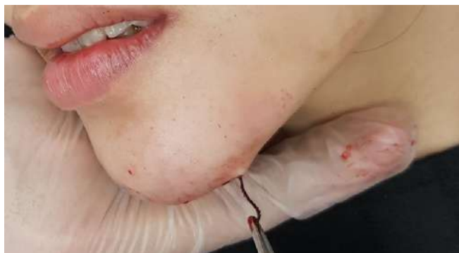
FIGURE 2 Treat thread extrusion by removing the thread